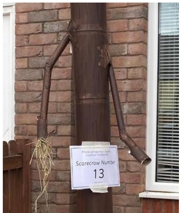
3rd Scarecrow #13 (Stickman)