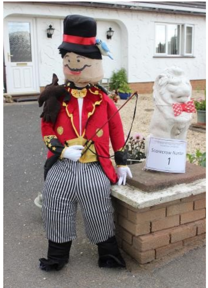
2nd Scarecrow #1 (The Greatest Showman)