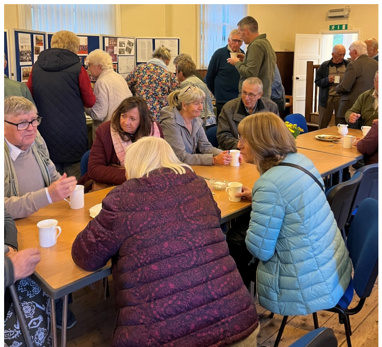
Socialising and looking at the exhibition of photographs and documents following the talk