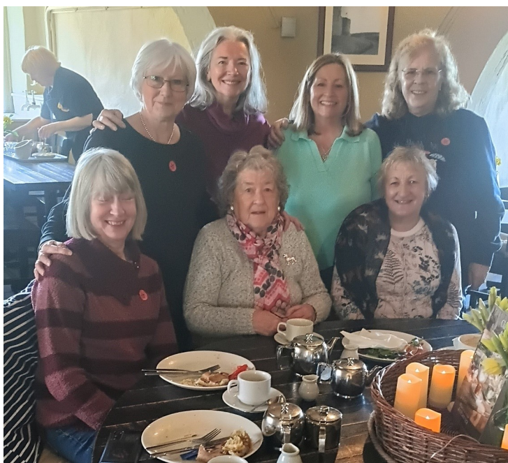
The members at Chirk Castle.